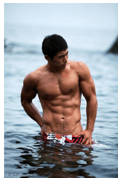
One of the stars of the "real" Manbang